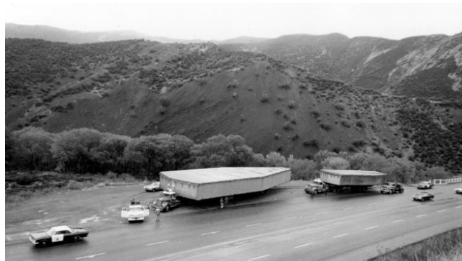
Fig. 3. First A-12 Delivery to Groom Lake

Funded by the CIA, and built by the Lockheed company, history continues to celebrate the genesis of the élan A-12 (later known as the SR-71 Blackbird) as an enduring symbol of American ingenuity, daring, technical brilliance, and institutional farsightedness. For all the praises that are sung in its name, this engineering marvel almost failed to materialize. To use a common metaphor, the A-12 was born out of wedlock, and of high dysfunctionality, which is often the case when new paradigms are proposed against the longstanding traditions, where institutions predictably cling to moribund ideals. Washington Turf wars, bureaucratic dysfunctionality, institutional power grabs, and significantly more than the usual share of technical challenges bloomed to a full; all this during the A-12's gestation, and much before it could exit the womb. Among the many struggles, orchestrating the availability of sustained research and development funding in a highly politicized world of intelligence program funds allocation, was, among other things, a principal necessity.