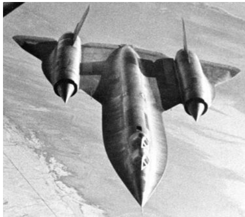
Fig. 2. A-12 About To Be Refueled

At approximately 10:10 AM local time (GMT), traveling at 2,143.90 mph, Murray points the A-12's Type 1 camera towards the coastline, and snaps a photograph, which would later confirm the presence of the Pueblo, in North Korean waters. During BX6847, Murray will have photographed 12 out of the 14 North Korean Surface-To-Air Missile (SAM) sites, in detail. In all, the imagery collected by BX6847 spanned two-thirds of North Korea, and Frank Murray will have spent just under 17 minutes over denied areas in total!